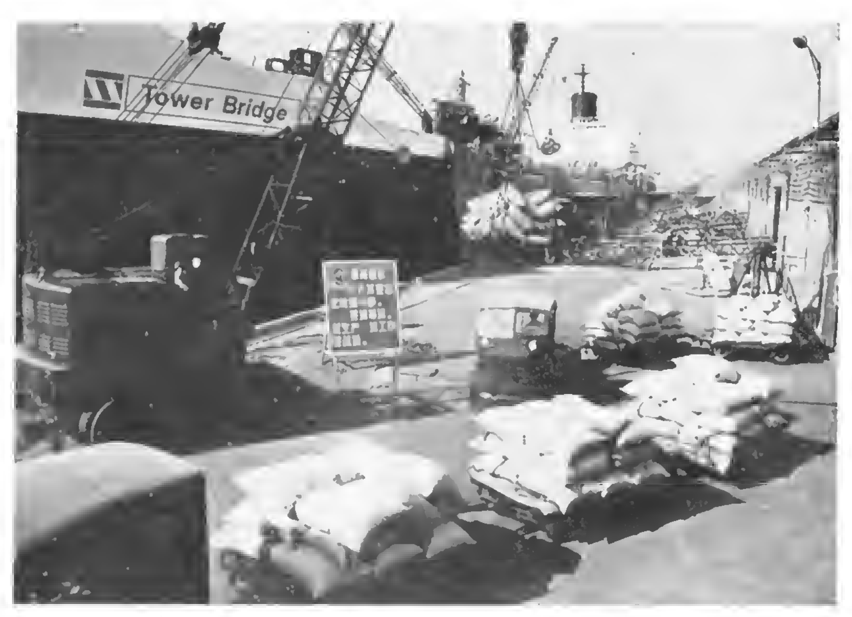
Cargo being unloaded by the revolutionary workers of the second loading area on Shanghai's docks.

loading and the time as their strategic task which they could certainly do but also recognized that they should plan each move earcfully and not underestimate the difficulties. They first of all made a careful study of their task. This was the freighter's first call at Shanghai and the workers were not familiar with vessels of its particular type. The unloading of such a big eargo was also something unusual and they were not sure how to plan the work. To get a better understanding of the situation, some workers boarded the Pentas before she actually doeked. This enabled them to get a first-hand look at the ship and its eargo and to make over-all arrangements. Thus the time taken up in preparations to unload was